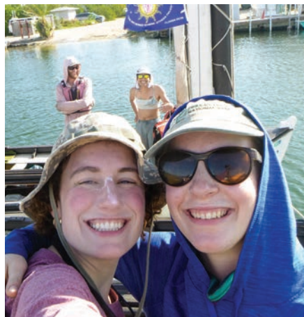
FLORIDA KEYS | Tequesta and Calusa land

For more than 30 years, the Dellora A. and Lester J. Norris Foundation has generously supported a week-long sailing program for students from Collier County, Florida. Every spring break, students representing a diverse district of 8 different high schools join us in the Keys for an expedition centered on community building and leadership development. Together we have served more than 650 STUDENTS OVER THREE DECADES . In recent years, we've had second-generation students: students whose parents attended the same course as teenagers in the 1990s!