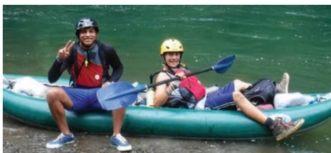
COSTA RICA | Bribri and Cabecares Land

When we had to end one of our semester courses early due to COVID precautions, the students chose to spend what would have been their final days on course together at one of the participant's homes. Even during a pandemic, they still finished their journey together!